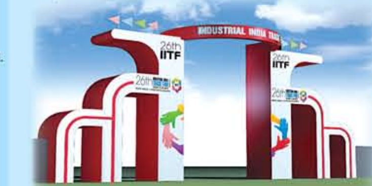
Entry Gate of 26th IITF

Entry Gate, Business Meet, Inaugural and Closing Ceremony, Cultural Programme, Entry Ticket Printing, Booking Counter, Light Box on Electric Poles, Indication Boards, Panel Boards at strategic location, Exhibitor kit, Own Popup Stands inside & outside Halls, Distribution of Company Literature, Hoardings, Wings of Backdrop on Stage and many more.